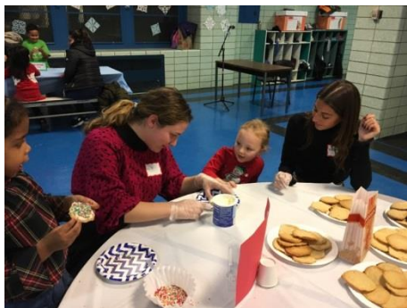
Staff volunteering at Winter Wonderland to help our children design their own cookies.