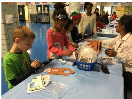
The arts and crafts tables at Winter Wonderland.