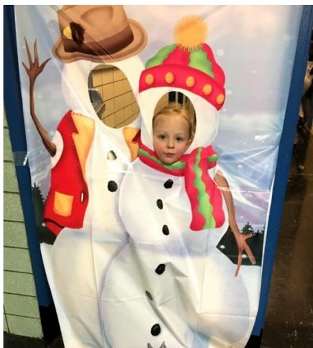
Winter Wonderland snowman photo stand in.